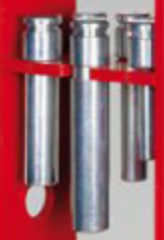
Set of punches. Optional.