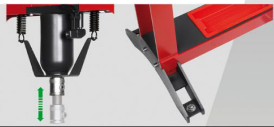
Manual screw extension for quick approach and fine adjustment.

Pressure gauge protected inside the frame. It is positioned at eye level to assist for easy reading. Supplied fully assembled and ready for work. Set of two V blocks included and legs with boltholes for fixing to the floor. Workbench adjustable for height.